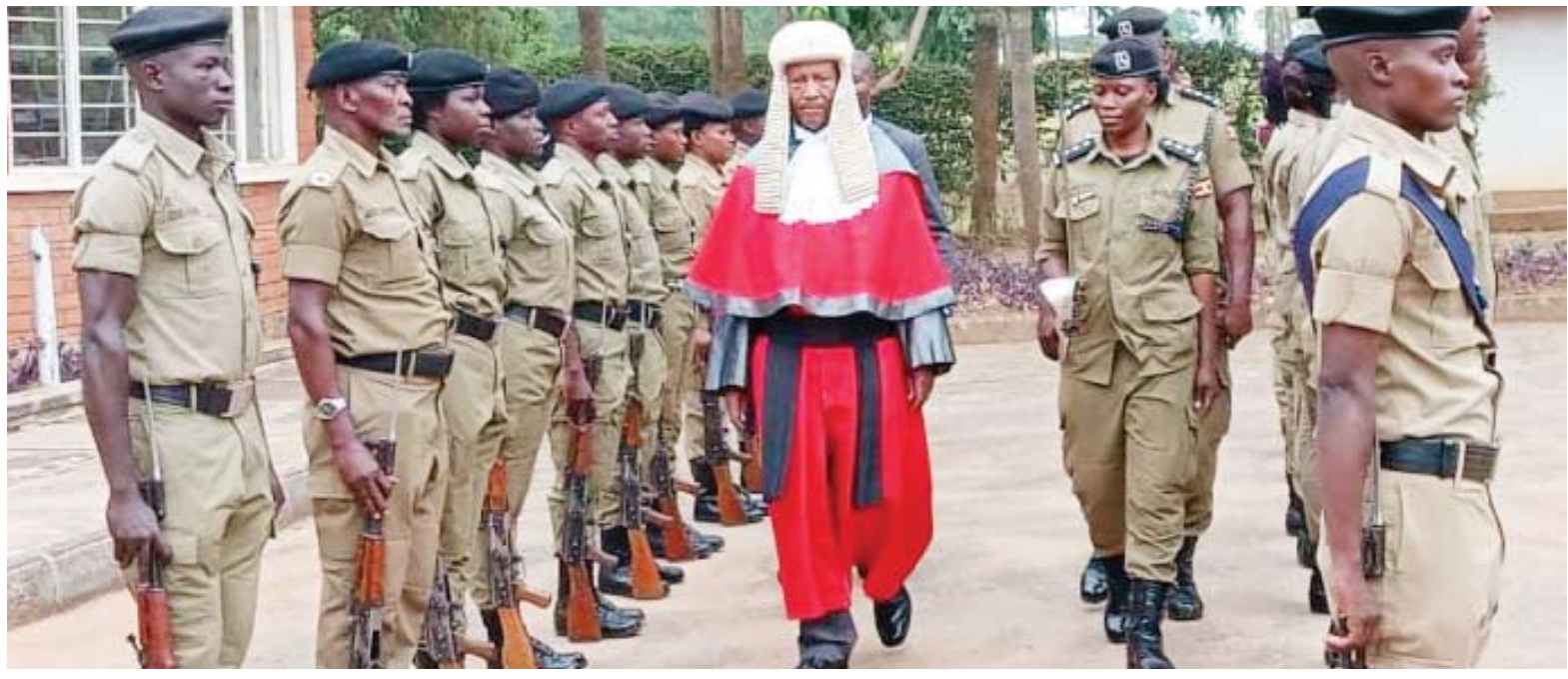
Deputy Chief Justice Hon. Justice Richard Buteera at the opening ceremony of the two-daty court of appeal special session in Mbarara

ublic trust in the justice system remains high and efforts to maintain it at higher levels are under implementation including addressing lead times for delivery of services, opening up of more service points, ensuring certainty in service delivery and making use of online services. This is contained in the Access to Justice sub-programme/JLOS Annual performance report for FY 2022/2023 released on December 1, 2023 in Kampala.