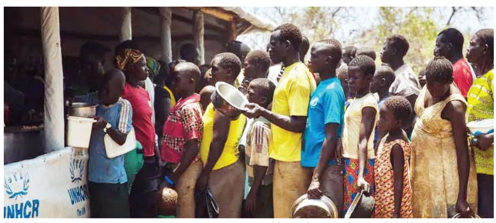
South Sudanese refugees queue for food at a reception centre in Arua, northern Uganda.