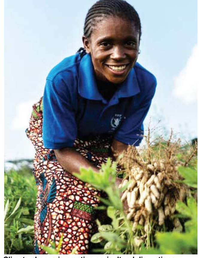
Climate change is creating agricultural disruptions

At the launch event on the fourth day of the COP28 United Nations' climate change conference in Dubai, government and institutional representatives expressed strong support